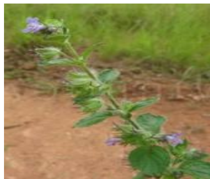
Fig:1: Hyptis suaveolens (L)

Stem, woody erect, light green in color, branching racemose as well as cymose angular young branches cylindrical. Leaves covered by hairs, simple estipulate, opposite decussate, sub sessile unicostate with crenate margin with dimension 8.7-10 x 6.2-7 cm, acute apex triangular petiole, color green. Flower is sessile, hypogynous, actinomorphic, and blue in color, tetracyclic. Inflorescence a terminal, branched, raceme of